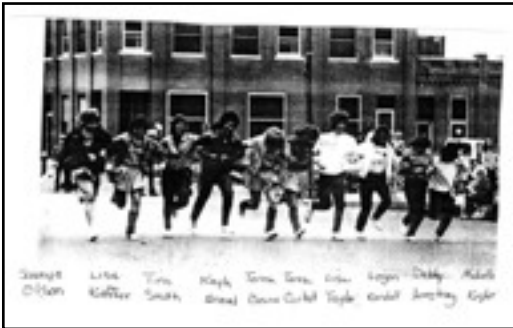
Above: First Play Day. Over 1500 attended

Following the parade the annual student foot races of students will take place on the Haviland State Bank lawn on Main Street, just north of the bank. Some bleacher seating will be available, and plenty of room is available for spectators who bring lawn chairs as they reminisce of Play Days gone by. Other race activities planned are egg races, hoop races and alumni races for everyone.